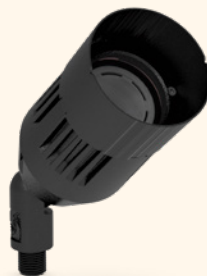
« Full Shield