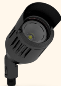
« Half Shield