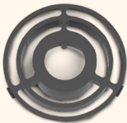
« Internal Source Shield