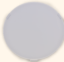
« Specialty Lenses