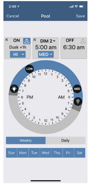
Vista Cloud Scheduling Screen